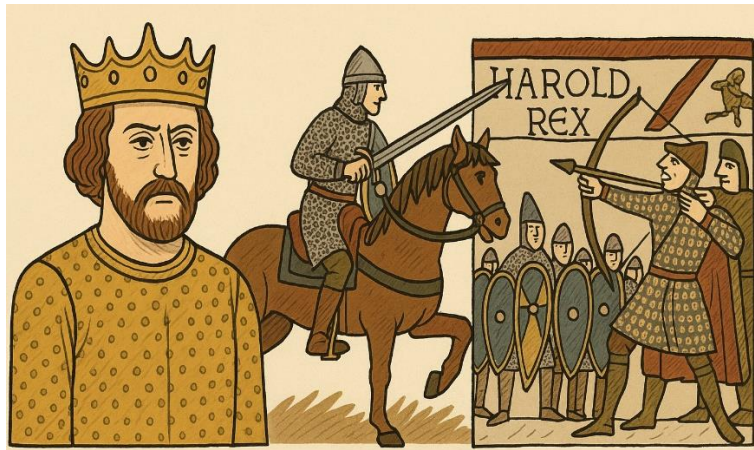
WILLIAM OF NORMANDY